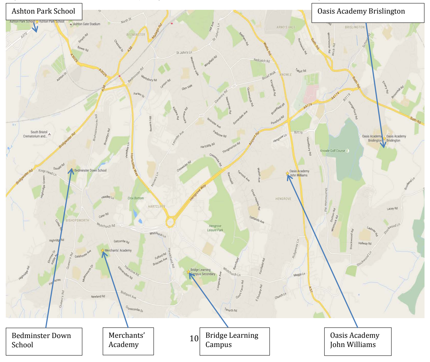
Fig. 2.1: Location of Schools Participating in the South Bristol Youth Ambitions Programme 2015/16

Fig. 2.1 is a map showing the location of the six schools participating in the SBY Ambitions programme 2015/2016. As Fig. 2.1 shows, Ashton Park school is to the North of the South Bristol area (Southville ward) while Bedminster Down (Bedminster ward), Merchants' Academy and Bridge Learning Campus (Hartcliffe ward) are to the South and Oasis Academy John Williams (Hengrove ward) and Oasis Academy Brislington (Brislington West ward) to the South East.